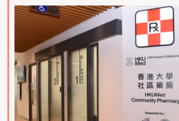
Pharmacy services supported by HKUMed Community Pharmacy